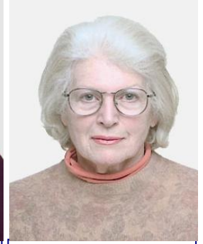
Acceptable But preferable to remove spectacles to avoid any possibility of your photo being rejected